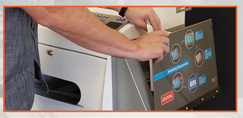
THE FULL PAGE DOCUMENT SCANNER is ideal for many HR related tasks: submitting and filing forms, applications, or official documents such as licenses or passports.

WITH OUR INTUITIVE SCANNING INTERFACE , users can quickly and conveniently submit their documents. With a printed or emailed receipt, they can be confident their documents were delivered to the correct destination.