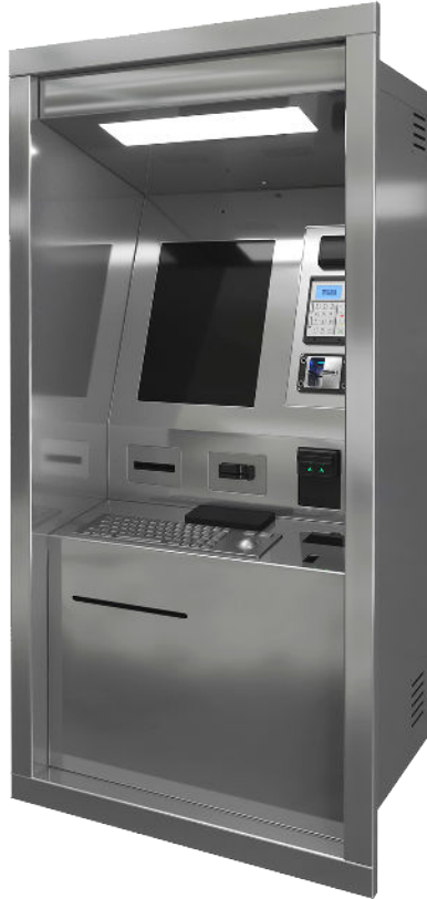
*Thru-Wall Kiosk (built in option)