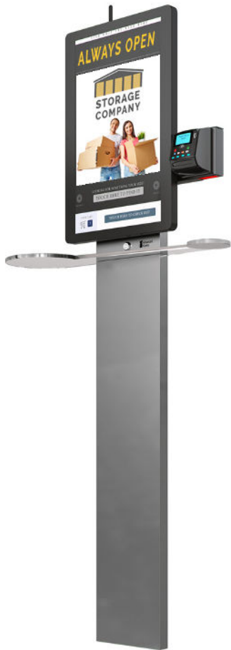
*Retail Kiosk (versatile mount)

Other kiosk models include wall mount, built in or weather proof outdoor options.