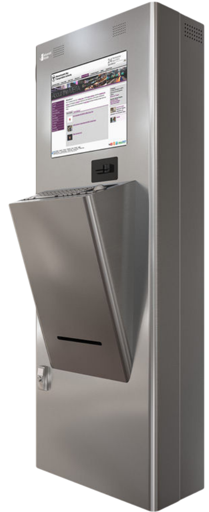
*Transit Kiosk (outdoor option)

Standard options and upgrades vary per model, please consult with one of our technical sales representative to determine the best solution for your needs.