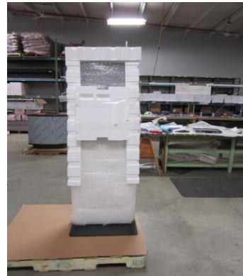
Merchant Max Before Box

You will then be left with the kiosk on the pallet like the picture above. Remove the box and protective wrapping on the kiosk.