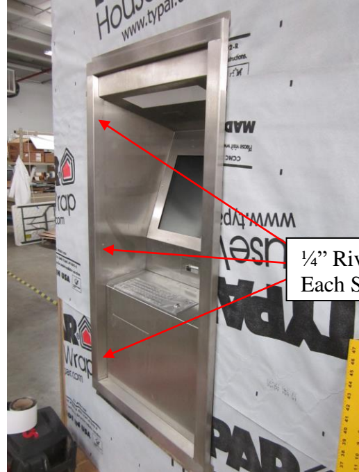
Kiosk with Front Bezel on