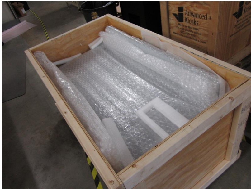
The Packaged Kiosk

Use a screwdriver to remove the screws on the crate cover. The kiosk will be carefully packaged with foam and bubble wrap in the crate. Take out foam and padding to reveal the kiosk and components. If anything looks wrong right away, refer to the support page.