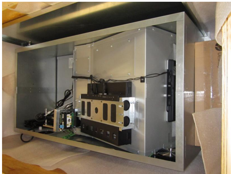
Kiosk Components Without Packaging