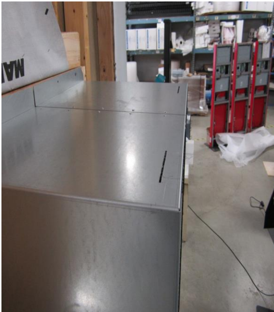
Top Two Grooves