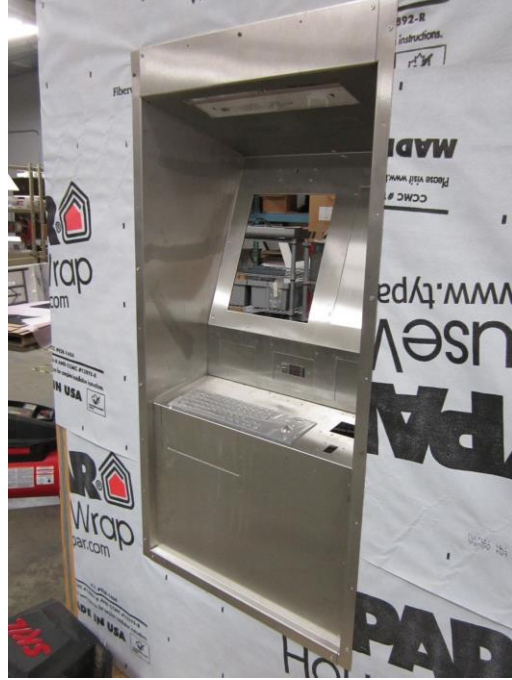
2. Kiosk Panel Mounted in Wall