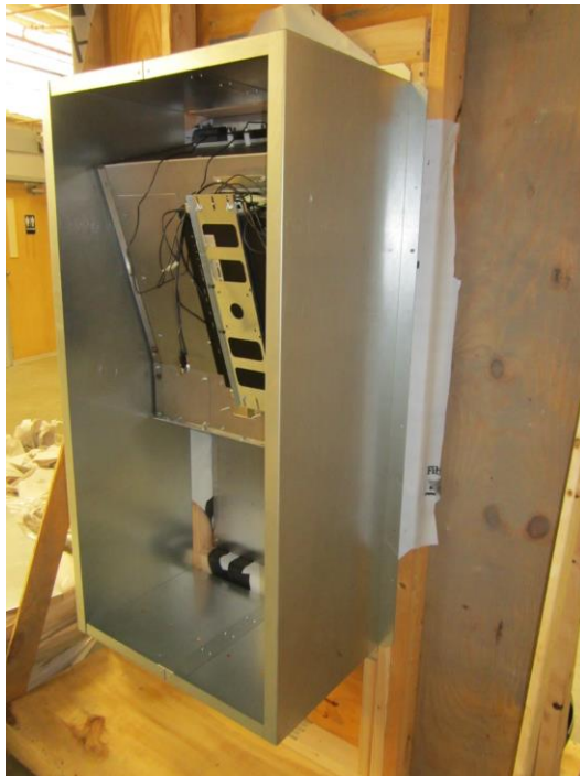
How Shroud should be mounted