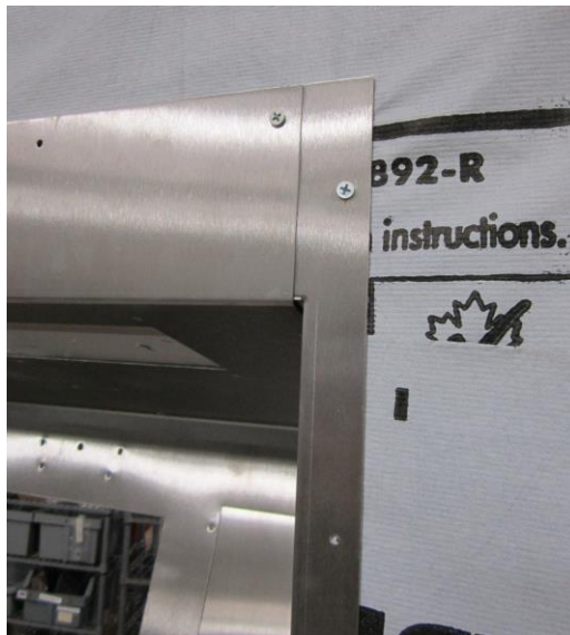
3. Screws in Wall