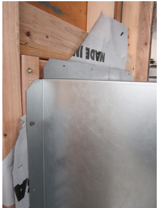
Shroud Mounts to Wall, Not Kiosk