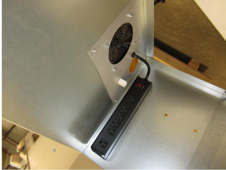
Power Brick, RJ45 Port, and Filter