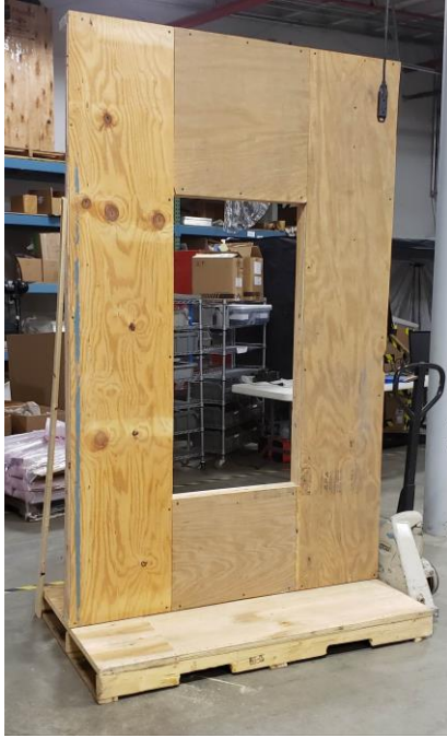
1. Wall With Cutout for Kiosk