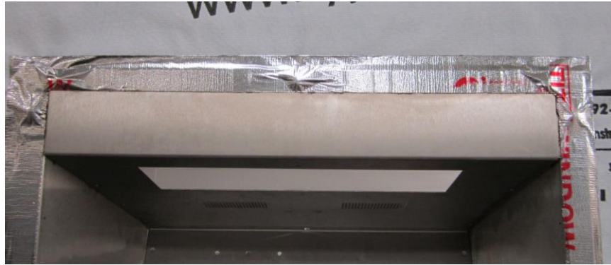
Ice & Water shield Placed over Metal Edges

WARNING: Do not use too much Ice and Water Shield, or you will have to tediously peel it off as shown below. Use the frame to show the extent of the Ice and Water Shield on the metal. Note: Use chalk or other marking agent to show the extent of the bezel before placing the Ice & Water Shield.