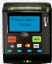
EMV CHIP READER